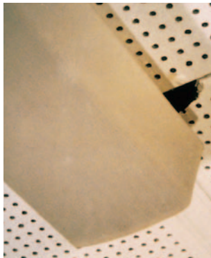
Perforated AIB ceiling tiles