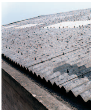
Asbestos cement roof