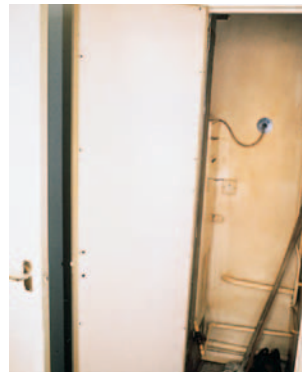
Door with AIB panel