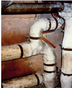
Asbestos pipe lagging