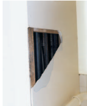
Asbestos insulation board (AIB)